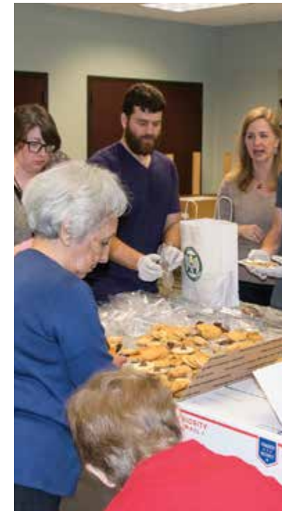
Staff packing Cookies for the Troops