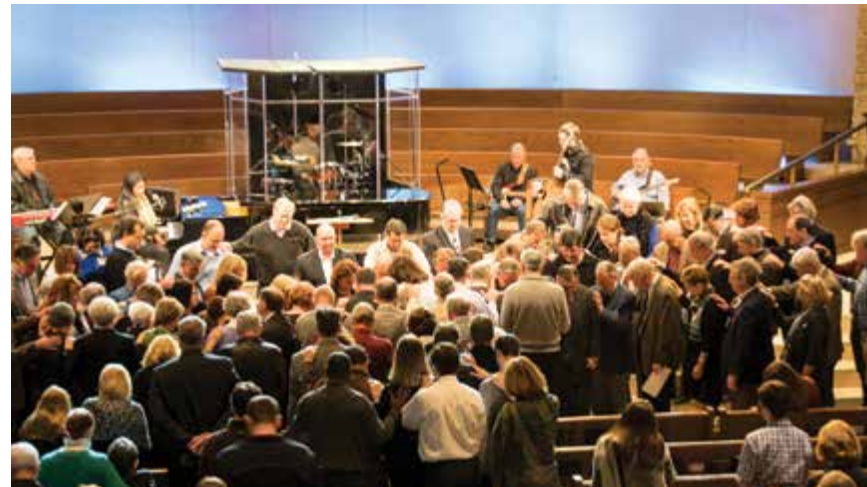
New Elder Installation and Ordination on January 8