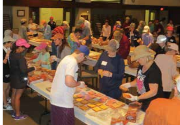
Kids' Meals volunteers make sandwiches for preschoolers