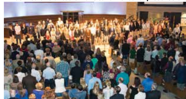
Confirmation Sunday (68 youth were confirmed!)