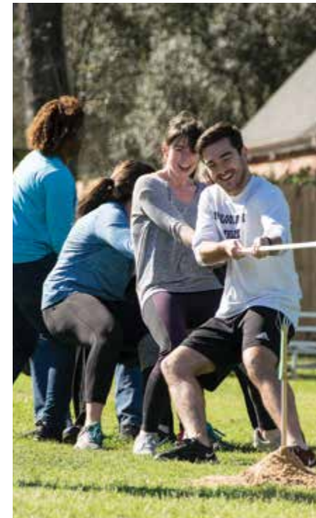
The struggle was real