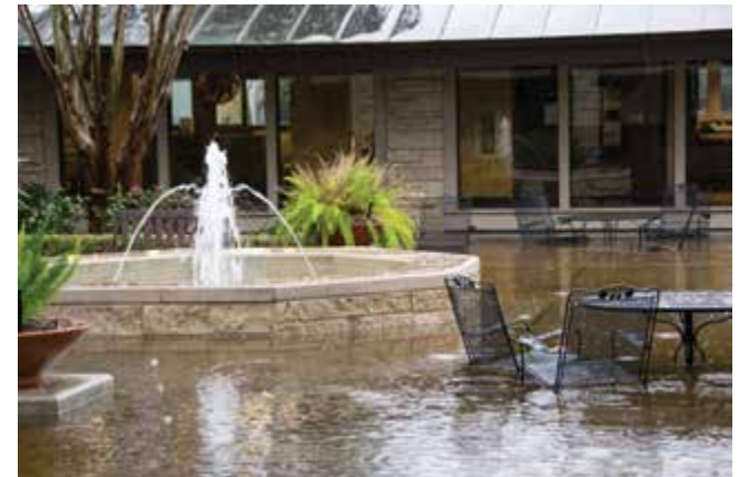
MDPC Courtyard after the January 18 rain