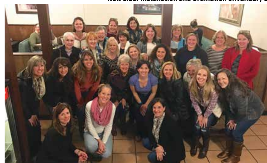
MDPC Women at the Girls' Getaway in February