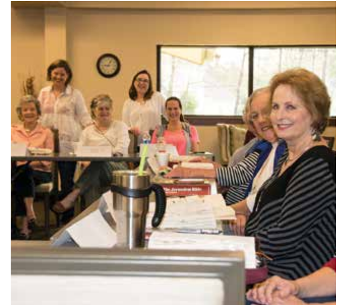
A few of the ladies from the Tuesday Bible Study