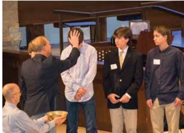
Four youth receive Believer's Baptism following Confirmation